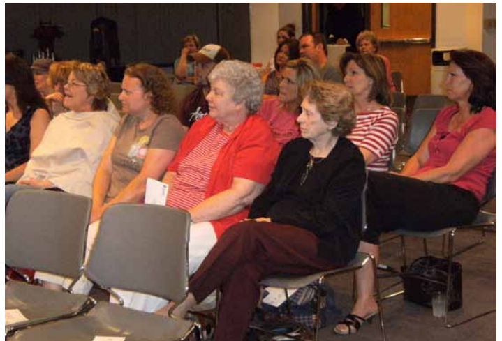
(Above) The Warrensburg preview of “Thine Eyes” was introduced by its producers who fielded many questions following the movie from a highly appreciative audience.

According to the producers, their goal in filming “Thine Eyes” is to document what the media refuses to show: that there were over a quarter of a million participants in this year’s march; that those who march are led by faith and commitment to witness for the sanctity of human life; that they come from all walks of life, ethnicities, ages, and religions; and that they will be back every year as long as abortion is sanctioned by our courts. “Thine Eyes” will inspire groups who have gone or are considering going to Washington for the annual march. Copies are available at www.thineeyes.org or by calling Missouri Right to Life.